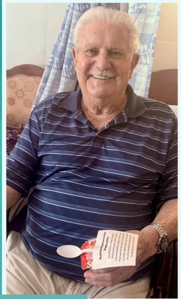
Cook out and National Butterscotch Pudding day