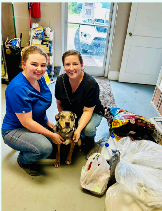
Donations to the Madison County Animal Shelter for National Dog Day