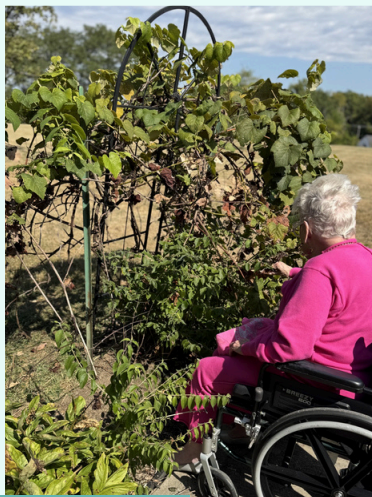
Lending a green thumb to brighten up the Telford Terrace patio