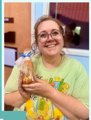
Hand soaps for employee appreciation!